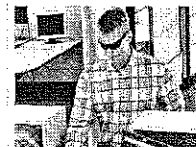
FBI Hunts '1-55 Bandit' Serial Bank Robber