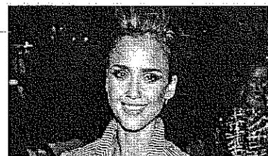
View: Celebs at Fashion Week Entertainment