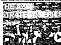
The next big thing in technology for asia (Singapore Sessions)