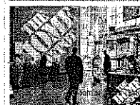
Home Depot Sued Over Shoplifter 'Profit Center'