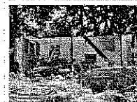
Home Mistakenly Demolished After Address Swapped