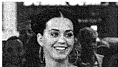
Katy Perry Roars Her Way to Top

Wouldn't you like to have Katy Perry roar into your school? CLICK HERE to enter between September 11th and October 1st for a chance for your school to win!