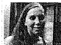
Ex-Sexting Partner Crashes Weiner's Election Night Party