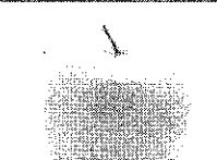
What Causes ADHD: Myths vs. Facts (Health Central)