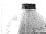
Get 'Real Answers' on What Food Expiration Labels Mean