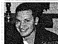
Newlywed Cliff Death Victim's Friend Was Suspicious of Bride