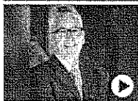
Former University Dean Trampled to Death by Elephant