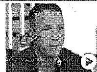
Marine Gets Beat Down Trying to Stop Bullying Attack