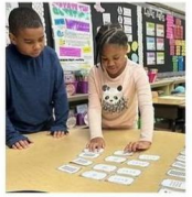
Students in Franklin Elementary Schools After School Program