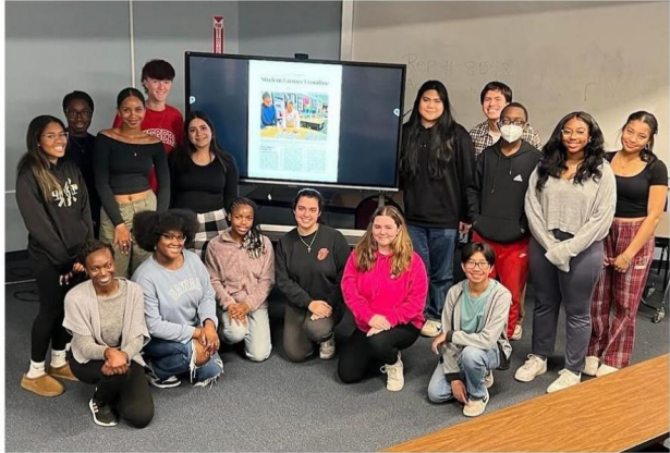
Introducing our 2023-2024 Student Farmer Frontline Committee!