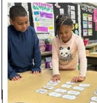
Students in Franklin Elementary School's After-School Program