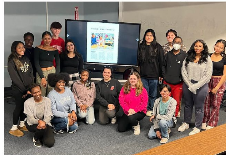
Introducing our 2023-2024 Student Farmer Frontline Committee!