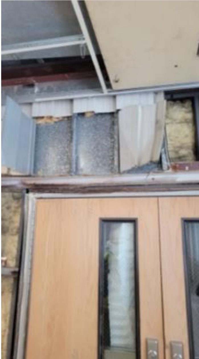
Demo Zone 3