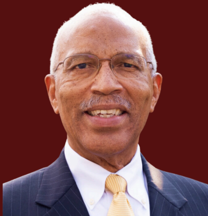
Ronnie McDowell Member